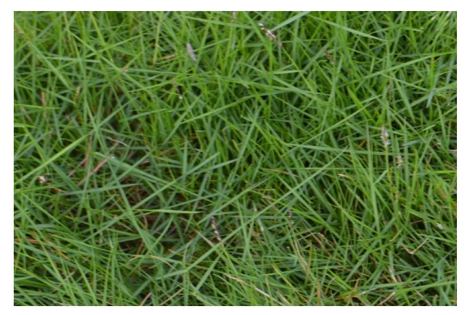
Figure 2. Zoysia grass.