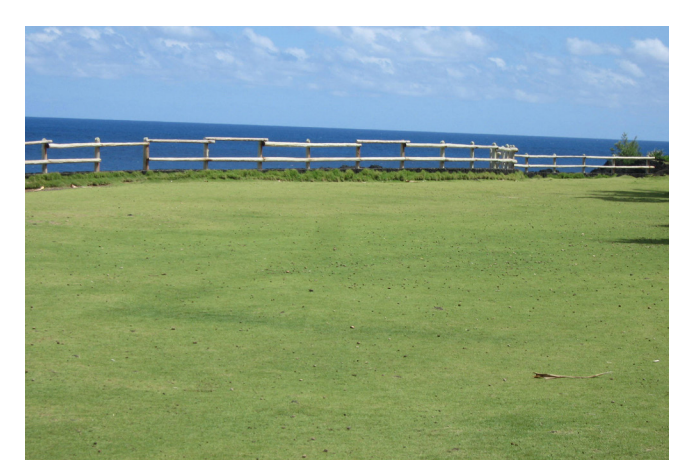
Figure 1. A lawn with zoysia grass.

The other zoysia species has much broader leaves and grows somewhat faster but still much more slowly then other grasses such as bermuda grass or centipede grass. Zoysia is often chosen for golf-courses, parks, and playgrounds but home-owners do not consider it the best choice for residential lawns. In the humid tropics it often suffers from insect damage. Sod web-worm is its worst pest and may infest this species several times a year. If overlooked during the time of massive invasion and not treated with chemicals, the sod web-worm can turn an entire lawn brown within a few days. Zoysia produces seeds, but its germination rate is quite low. Zoysia lawns are usually established vegetatively with sod, sprigs, or plugs