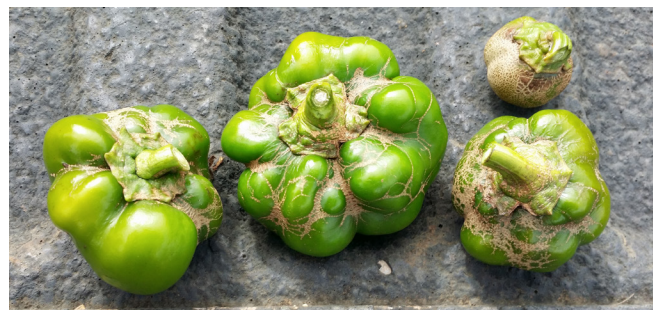
Fig 7. Heavy mite infestation on immature fruit.