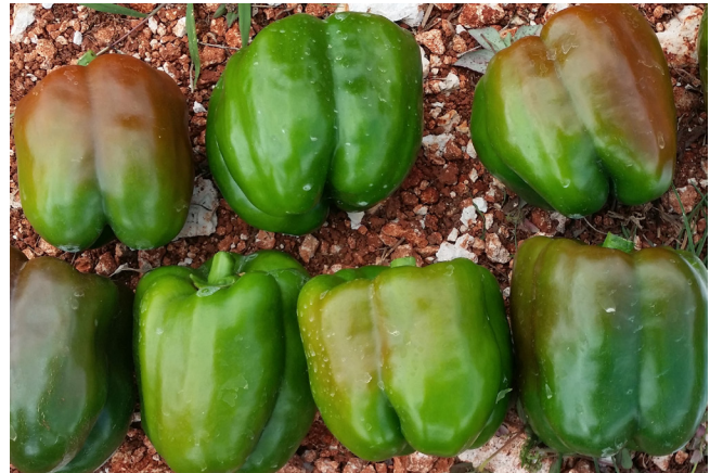
Fig 4. King Arthur F1 harvest at mature green stage.

All varieties produced marketable quality green fruit, but as indicated earlier, most fully maturing fruits were infected with anthracnose fruit rot (Fig. 4, Fig. 5, and Fig. 6). Gourmet F1, in particular, was singled out to await full maturity because of its attractive orange color when fully ripened. In local stores, orange and yellow bell peppers are sold at a range of $4.99-$6.99/lb versus mature green and fully ripened red bell peppers which are commonly sold at a range of $3.99-$4.99/lb. Sun scalding, fruit damage from extreme exposure to sun rays, occurred on a few fruits, particularly those not protected from canopy/leaf cover. Heavy thrip and mite infestations were apparent in the first week June. These infestations inhibited plant productivity resulting in very poor growth and development of immature fruits (Fig. 7). Fig. 8 are bar graphs depicting results from harvest data from the variety trial.