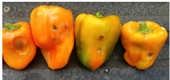
Fig 6. Gourmet F1 harvested at full maturity infected with Anthracnose fruit rot.