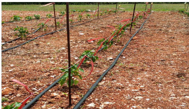
Fig. 2. Bell pepper varieties grown in Guam Cobbly Clay Loam in Yigo, Guam.

A variety trial was conducted at the Western Pacific Tropic Research Center, Yigo Agricultural Experiment Station, College of Natural and Applied Sciences, University of Guam (Fig. 2). On March 24, 2016, five varieties of bell pepper were transplanted in Guam Cobbly Clay Loam soil, a commonly cultivated soil in northern Guam, after growing in plant trays for 24 days.