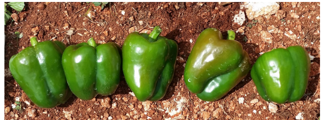
Fig 5. Intruder F1 harvest at mature green stage.