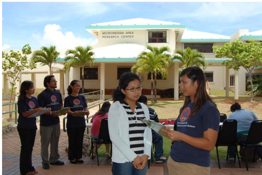
Figure 4. National Alcohol Screening Day, University of Guam, April 2009.

member through suicide. These support services are designed to be culturally responsive by incorporating Pacific Islander and Asian American cultural values. For example, interventions emphasizing the importance of interpersonal relationships, family, community, and culture are favored over individualistic models of behavior change that focus on the self. To increase students' comfort with accessing support services, a peer-facilitator model is used, with Pacific Islander and Asian American graduate and undergraduate students serving as counselors, group facilitators, outreach coordinators, and suicide prevention trainers.