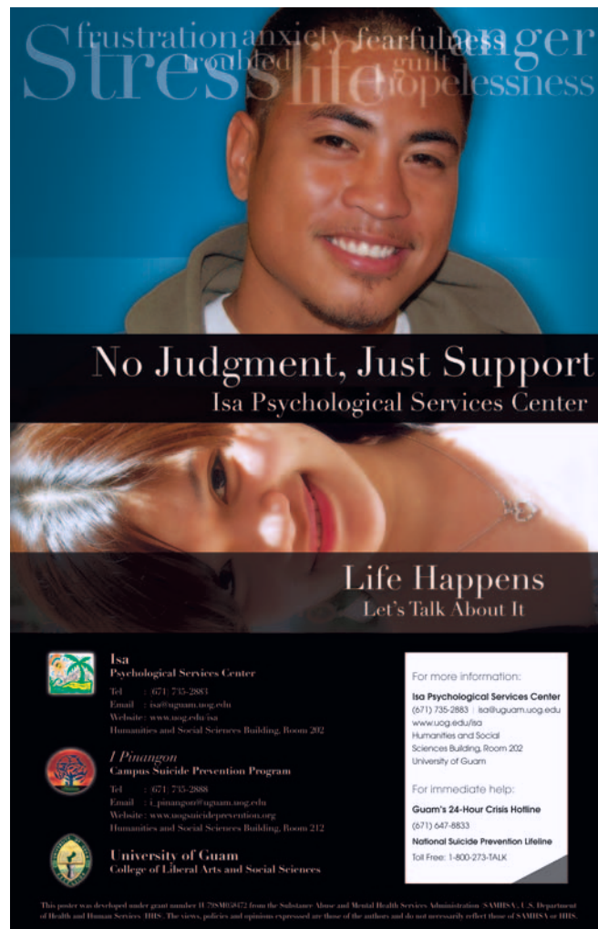
Figure 3. “Life Happens—Let’s Talk About It” Poster Featuring Positive Images of UOG Students

5. Increase student access to and participation in culturally responsive mental health support services. Several mental health support services have been developed. I Pinangon serves as a resource facility for UOG students, staff, faculty, and members of their families seeking suicide prevention information and assistance. Isa (“rainbow” in Chamorro) Psychological Services Center was created to provide on-campus mental health treatment to students and members of their families. Personal growth retreats (Smith, Smith, & Twaddle, 1998) and men’s and women’s support groups (Twaddle, Lee, Mansfield, Sablan, & Mendiola, 2007) are offered to students living in the student dormitories. Outreach mental health screenings, including National Depression Screening Day and National Alcohol Screening Day (see Figure 4), provide at-risk students with immediate referrals to campus and community-based treatment providers. Suicide postvention grief counseling is offered to individuals and families bereaved by suicide, and suicide postvention debriefing is provided to groups and organizations that have lost a