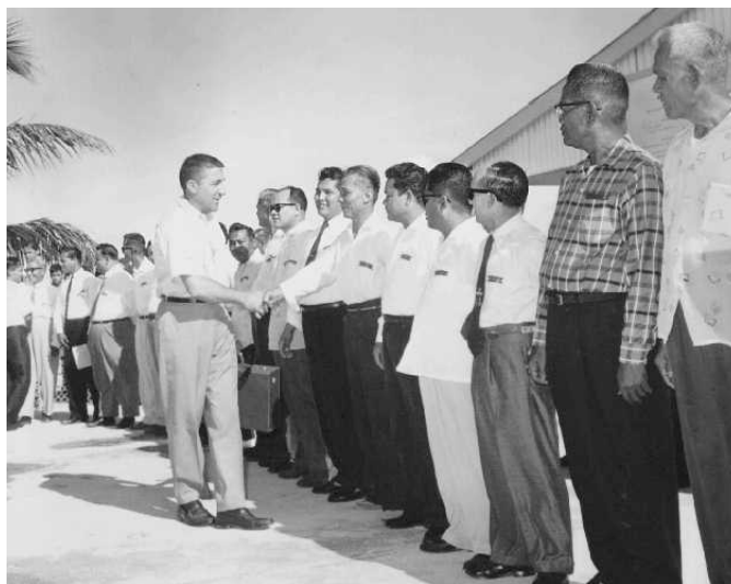
Secretary Udall visits Trust Territory headquarters in Saipan, 1962.

In February 1963, the task force recommended an increase in Peace Corps volunteers. That decision helped the educational system in the FSM by training teachers and has continued to the present. On May 9, 1963, Anthony V. Solomon headed an important mission to research the Trust Territory and make recommendations. One surprising discovery was that U.S. officials wanted to preserve local traditions and not teach English, but the islanders were wanted to learn English and embrace modern views. Solomon recommended a 1967 or 1968 Micronesian vote between independence and permanent affiliation with the U.S. (as cited in Willens and Siemer, 2000, pp. 42–43).