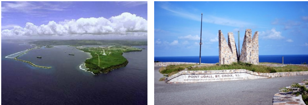
Left: Point Udall, Guam; right: Point Udall, St. Croix, Virgin Islands.