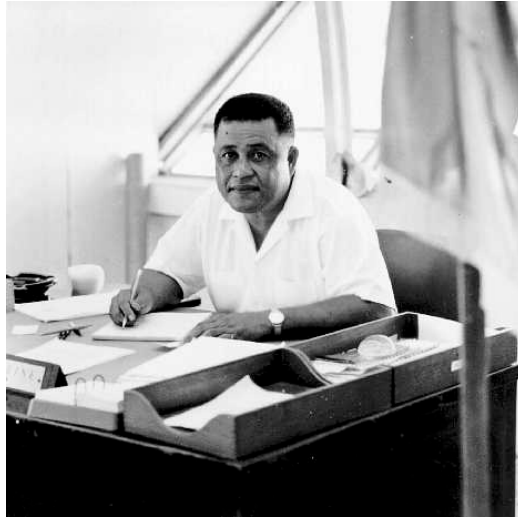
Dwight Heine of the Marshall Islands chaired the Council of Micronesia and helped form the Congress of Micronesia.

Continental Congress worked out the differences between “the merchants of Boston and the planters of Virginia.”