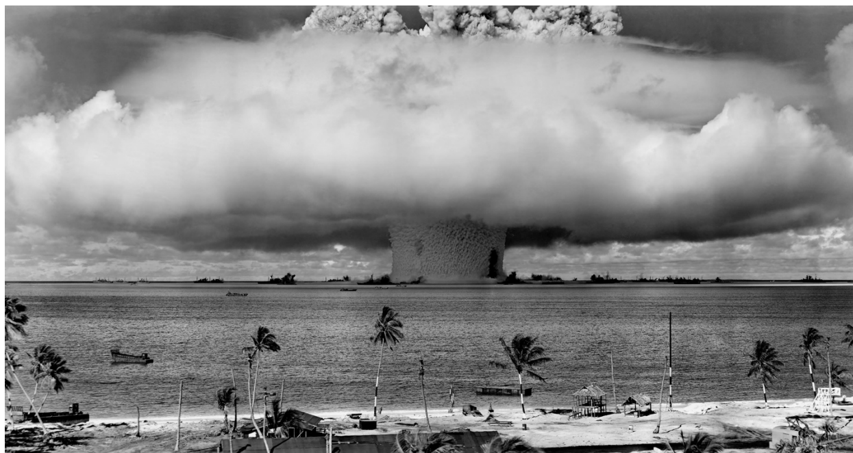
The “Baker” explosion, part of Operation Crossroads, a nuclear weapon test by the U.S. military at Bikini Atoll on July 25, 1946.

Meanwhile, the U.S. military machine was churning out and testing weapons of mass destruction, and nuclear testing began in 1946 on Bikini and Eniwetok atolls in the Marshall Islands. Until 1958 some 67 tests were conducted, causing severe health risks for the people of the Marshall Islands (Skoog, 2003, p. 69) and initiating Cold War tensions with the Soviet Union.