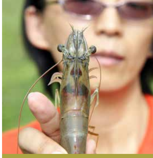
A public-private partnership is being explored for the UOG Hatchery.