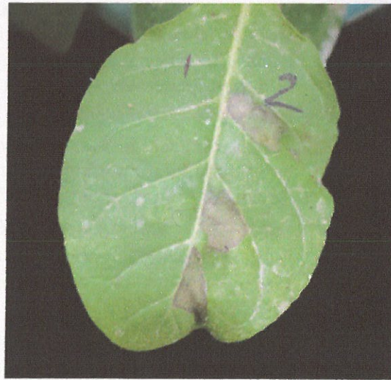
Fig. 2. Isolate "1" was tobacco hypersensitive negative and isolate "2" (three patches) was tobacco hypersensitive positive.

Turn the leaf over, bottom up, hold the needle or syringe