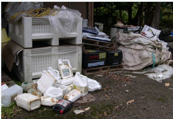
Improper pesticide storage.