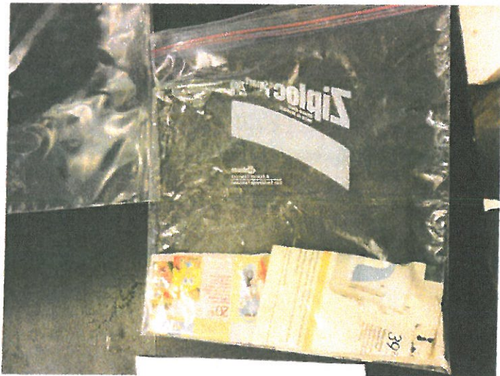
Unwrapped sample (top) and sample wrapped in newspaper (bottom).