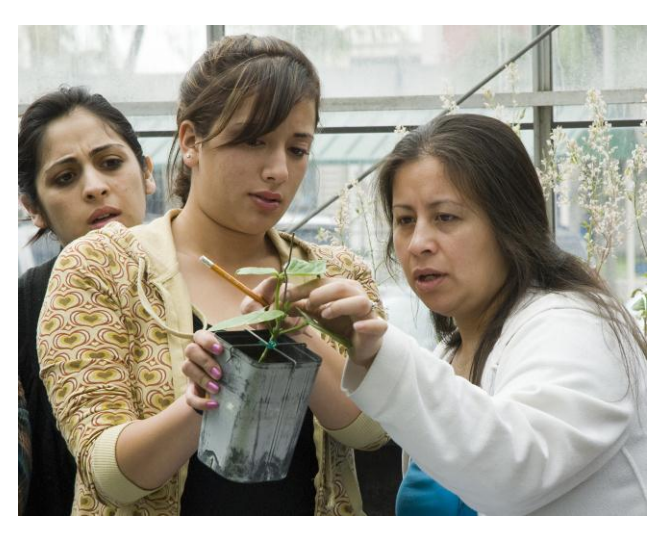
California State University, Los Angeles

Do students and faculty members work together on committees and projects outside of course work? 45% of FY students at least occasionally spent time with faculty members on activities other than coursework.